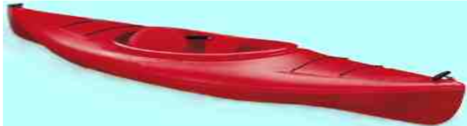
The color of the kayak being raffled off is 'Parker green'